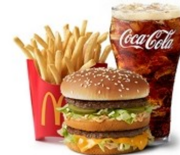
Big Mac® Meal