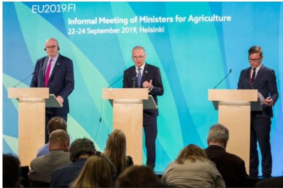
Informal Agricultural Council, Helsinki, September 2019