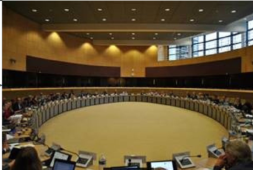
EU Carbon Farming Roundtable, Brussels, October 2019